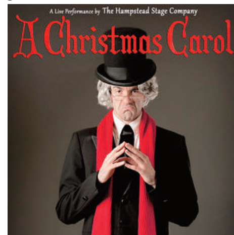
Hampstead Stage Company